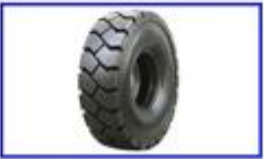
Solid rubber tire Explosion proof tires are safer