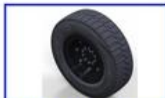
Solid rubber tire Explosion proof tires are safer