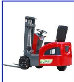
THREE POINT FORKLIFT