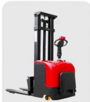
CDD-25 STANDING STACKER