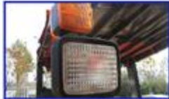
LED searchlight You can see clearly even when working at night