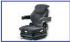
Adjustable seats Seat suspension design Adjustable back and forth