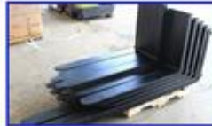
Thickened forged Integrated forged forks are more sturdy and durable