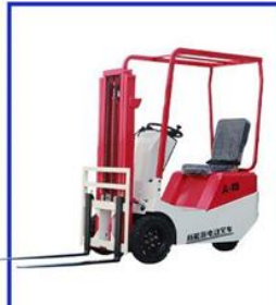
THREE POINT FORKLIFT