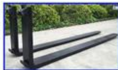
Thickened forged Integrated forged forks are more sturdy and durable