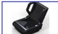
Adjustable seats Seat suspension design Adjustable back and forth