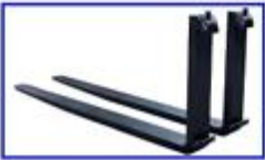
Thickened forged Integrated forged forks are more sturdy and durable