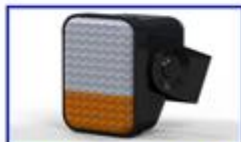
LED searchlight You can see clearly even when working at night