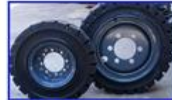
Solid rubber tire Explosion proof tires are safer