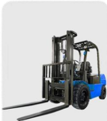
CPD-20 ELECTRIC FORKLIFT