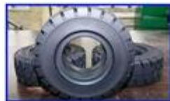
Solid rubber tire Explosion proof tires are safer