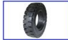
Solid rubber tire Explosion proof tires are safer