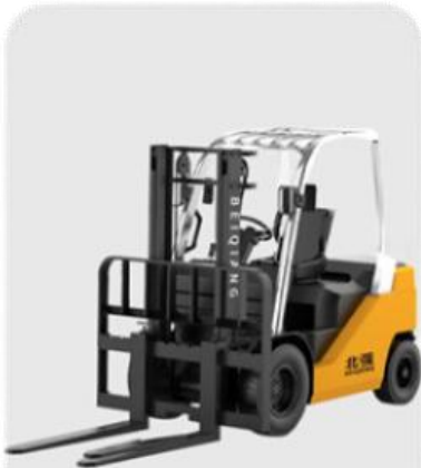
CPD-30 ELECTRIC FORKLIFT