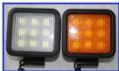
LED searchlight You can see clearly even when working at night