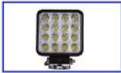
LED searchlight You can see clearly even when working at night