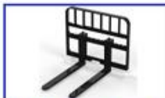
Thickened forged Integrated forged forks are more sturdy and durable