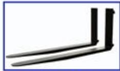
Thickened forged Integrated forged forks are more sturdy and durable