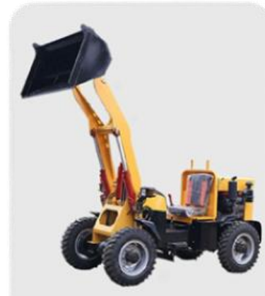
CPB-30 ELECTRIC FORKLIFT