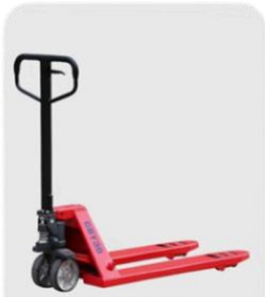
CBY-30 MANUAL PALLET TRUCK