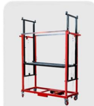
CPY-15 ELECTRIC SCAFFOLDING