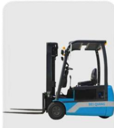
CPD-10 THREE POINT FORKLIFT