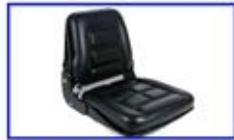
Adjustable seats Seat suspension design Adjustable back and forth