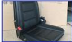
Adjustable seats Seat suspension design Adjustable back and forth