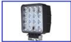
LED searchlight You can see clearly even when working at night