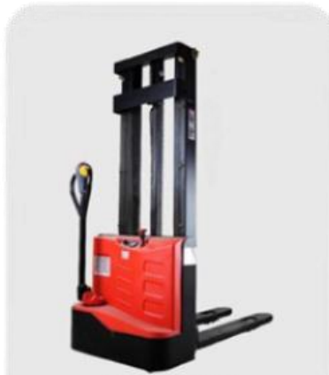
CDD-15 WALKING STACKER