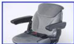
Adjustable seats Seat suspension design Adjustable back and forth